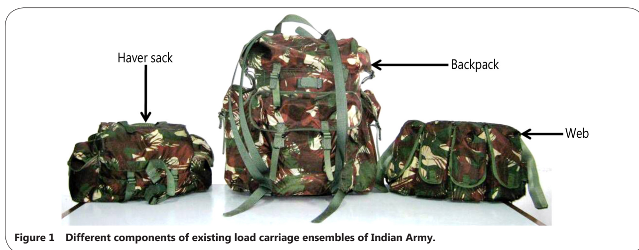
Figure 1 Different components of existing load carriage ensembles of Indian Army.

al.[10,11] established standards of optimum load carriage at varying speeds and gradients for Indian Army soldiers on plains based on the energy cost, oxygen requirement and relative workload of the specific task. In the first study, they applied loads of up to 40 kg to Indian soldiers at varying speeds of 3.5 and 4.5km/h. Loads of 36.1 and 21.4kg were recommended for carriage at 3.5 and 4.5km/h speeds. In the other study, loads of up to 21.4kg were carried by Indian soldiers at a speed of 4.5km/h at 0, 5, 10 and 15% gradients. A linear regression equation was applied to calculate the optimum load for each gradient and speed.